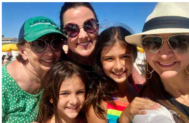
Clearwater Beach with one of my best friends & her kids

Many of my friends have children and it's great to spend time together, play with them and watch them grow up, and looking forward to “play dates” in the future.