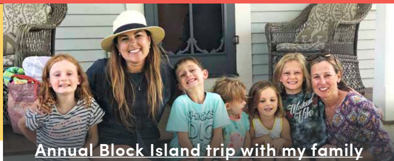
Annual Block Island trip with my family

I grew up in a neighborhood where we constantly outside playing with our friends, enjoying family picnics , going to summer camp and sledding and ice skating in the winters. I would like to provide a child with a childhood like this, filled with simple pleasures and fun.