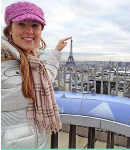
My dream trip to Paris