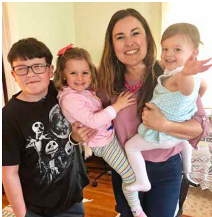
My heart! My nieces and nephew