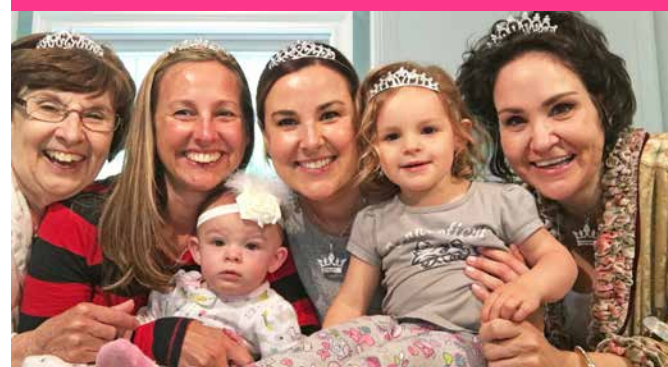
Celebrating the royal wedding with the girls

My brother also lives near my sister and I see him regularly with my 11 year old nephew who calls me the "fun aunt" . My nephew is a good big cousin to my nieces.