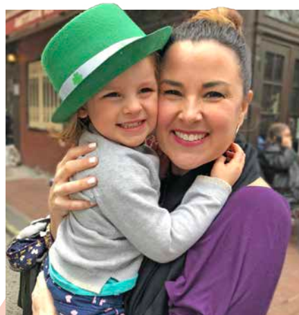
My niece's 1st St. Patrick's Day in NYC