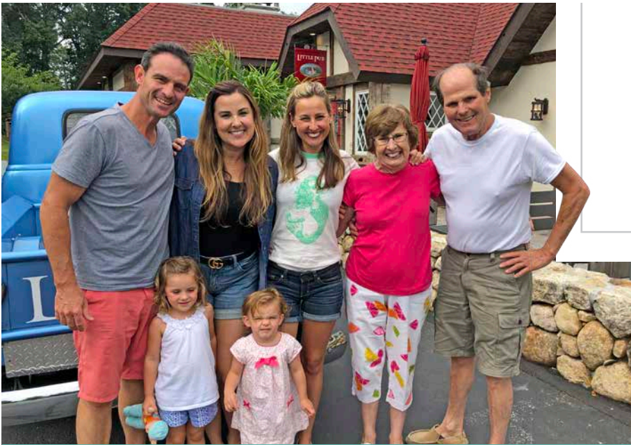
An outing with my parents, sister, and her family