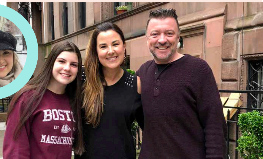
5 th annual trip to NYC with my friend from high school and our friend's daughter

I grew up in a neighborhood where we constantly outside playing with our friends, enjoying family picnics , going to summer camp and sledding and ice skating in the winters. I would like to provide a child with a childhood like this, filled with simple pleasures and fun.