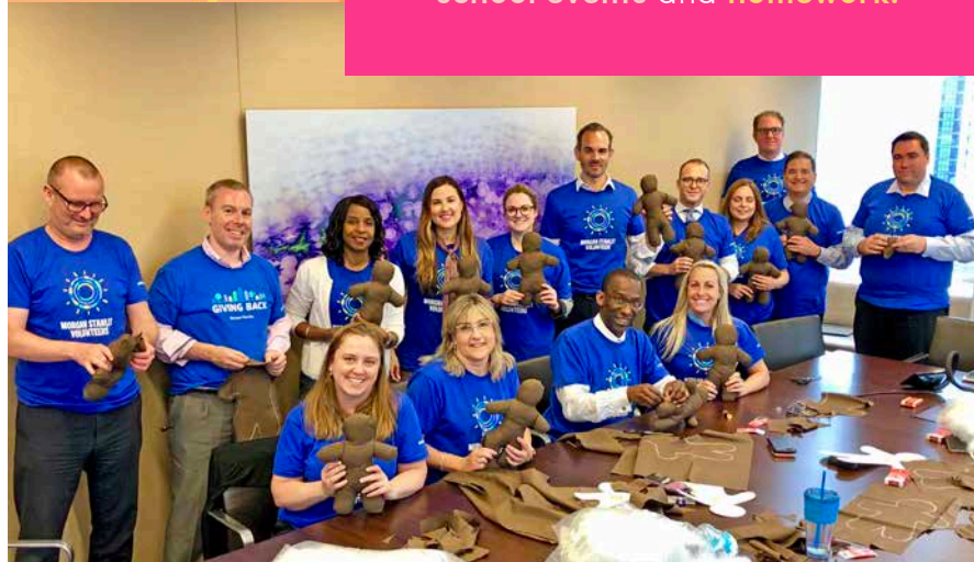
Leading a volunteer activity at work for children in local hospitals