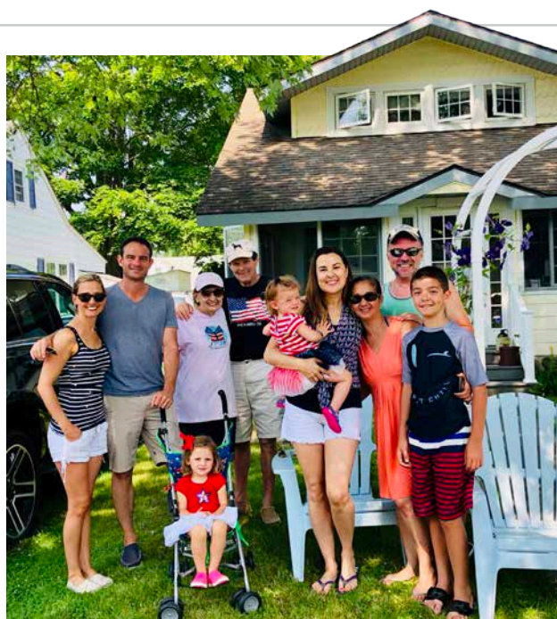
4 th of July tradition at our cottage with friends and family