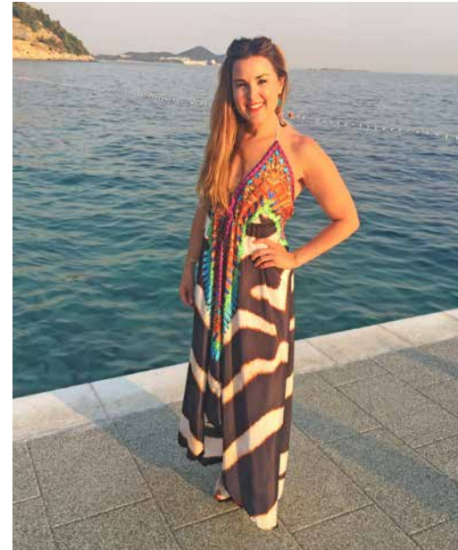
Croatia is one of my favorite places!

I like to travel to new places to have new experiences and learn about other cultures. I have been to several countries in Europe with my friends, as well as a memorable family trips and Caribbean cruises. I also enjoy taking local road trips in New England as it's so beautiful there in any season.