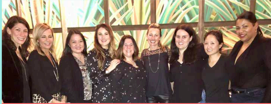
Birthday in NYC with my loyal and amazing group of friends!